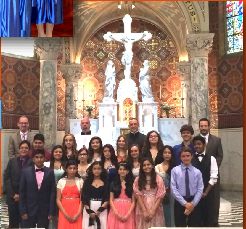
The graduating 8th Grade Class of St. Cecilia School & Academy.