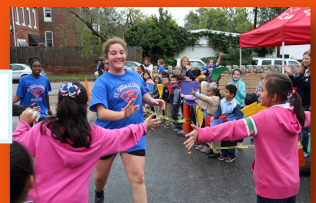
Runners for St. Cecilia's 5K focus on healthy habits & raise money for various causes.