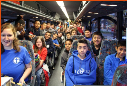
Students travelled to Camp Lakewood for a retreat to promote teamwork and leadership.

Adventures from the 2014-2015 School Year