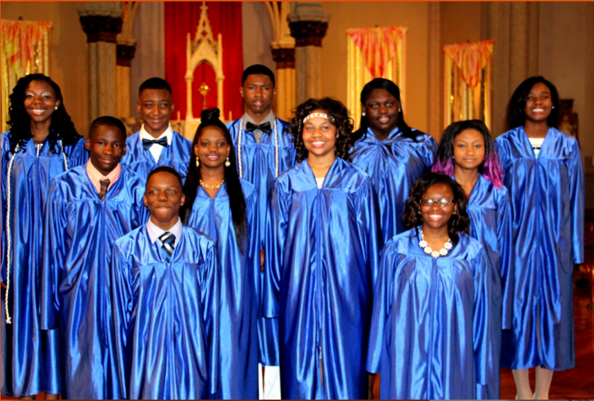
The 166th Graduating 8th Grade Class of Most Holy Trinity School & Academy.