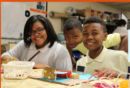
Students create projects while learning complex problem solving skills in Building Futures.