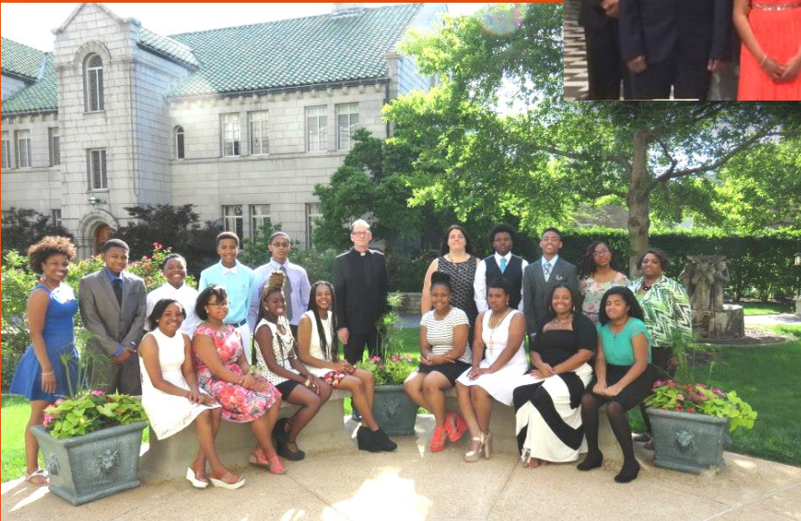
The 8th grade class from St. Louis the King School at the Cathedral.