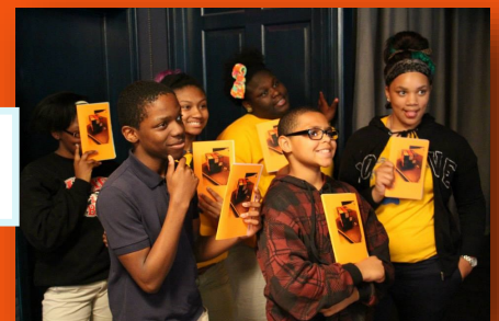
Poetry Slam students showcase original works for their end-of-year presentations.