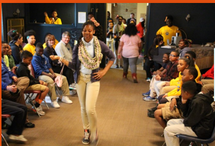
Fashion students model their crocheted creations for their end-of-year presentations.