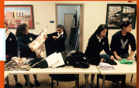
Students tour and volunteer at St. Patrick Partnership Center in downtown St. Louis.